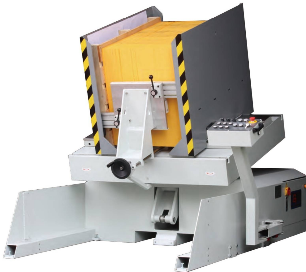
機械尺寸 (Machine Dimensions)